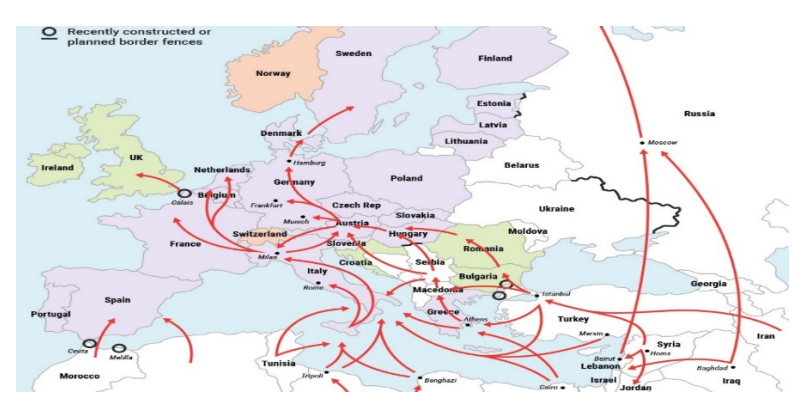
Map 1: